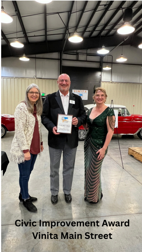
Civic Improvement Award Vinita Main Street