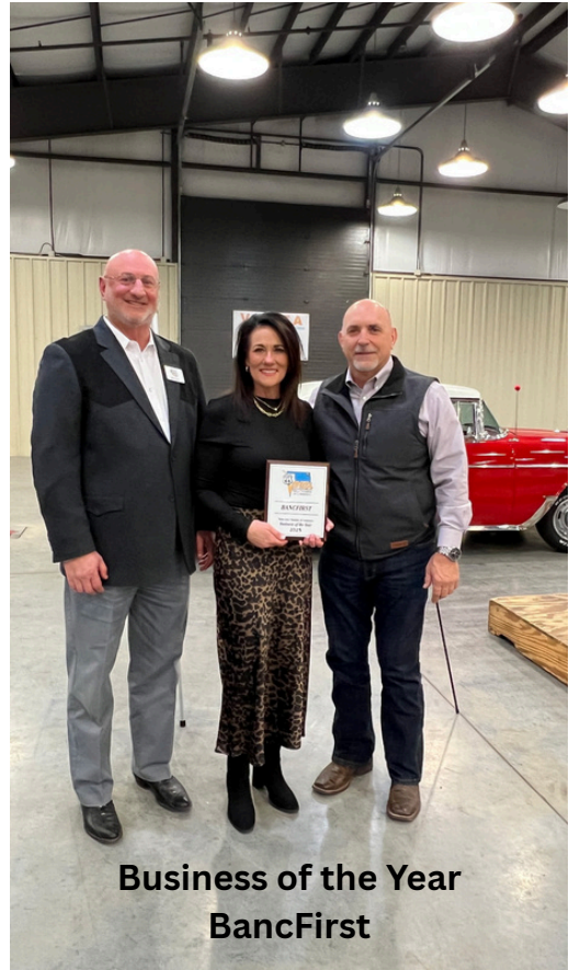
Business of the Year BancFirst