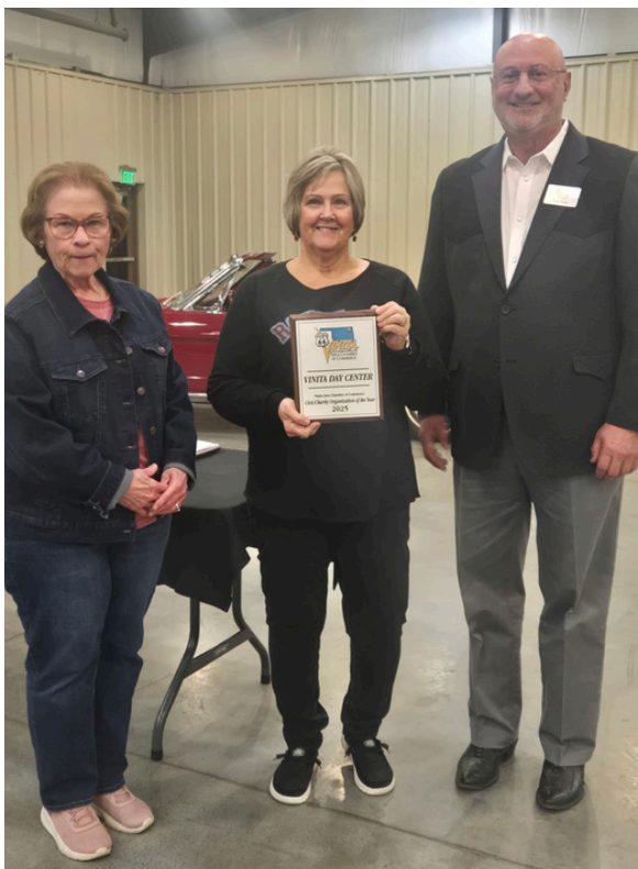
Civic Organization of the Year Vinita Day Center